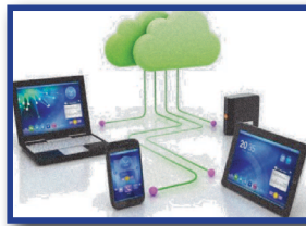
Cloud Systems and Services