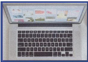
Networked Workstations and Laptops

BOC ensures the security of your devices and the integrity of the information on them. Your employees will be able to count on access to their tools and data. Access methods can include: